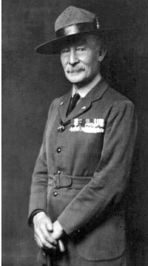
Robert Baden-Powell founder of the Scout movement

“The most worth-while thing is to try to put happiness into the lives of others.”