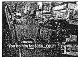
You do him for $350...OK?

Not bad for 20 minutes of work. Welcome to the wide world of kickbacks — the quick cash transactions keeping