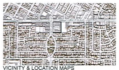
VICINITY & LOCATION MAPS