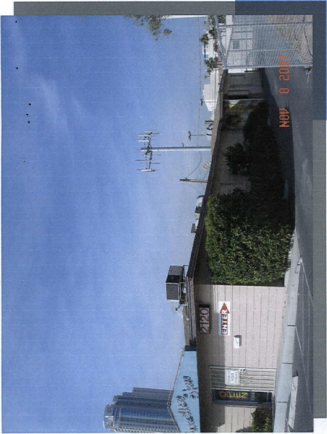
Existing 45' Monopole

Existing 45' Monopole to be Extended 13' with 2 Additional Flush-Mounted Carriers