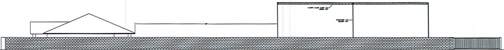
3 EAST ELEVATION SCALE: 1/8" = 1'