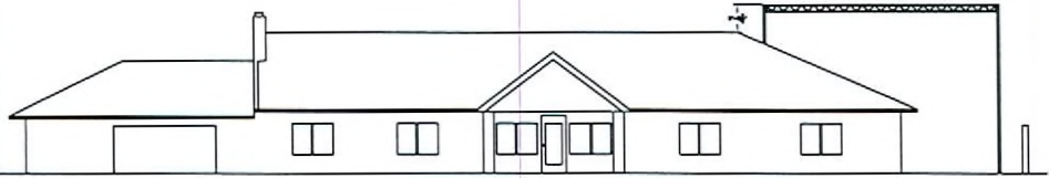
1 SOUTH ELEVATION SCALE: 1/8" = 1'