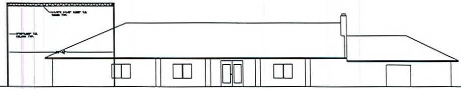
2 NORTH ELEVATION SCALE: 1/8" = 1'