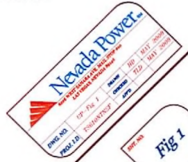
Fig 1 of 2