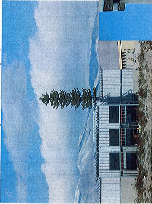
Example of Existing Site with Monopine