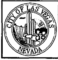
EXHIBIT "A" AS-BUILT CURB RETURN @ THE CORNER OF CLARK AVE. & 3RD ST. CITY OF LAS VEGAS, CLARK COUNTY, NEVADA CITY OF LAS VEGAS - SURVEY 3001 RONEMUS DRIVE, LAS VEGAS, NEVADA 89128 (702) 229-6217

DRAWING: THIRD ST & CLARK DRAWN BY: HJB CHECKED BY: ARR DATE: 06-16-2008