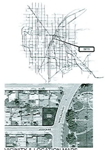
VICINITY & LOCATION MAPS Site and Project Information