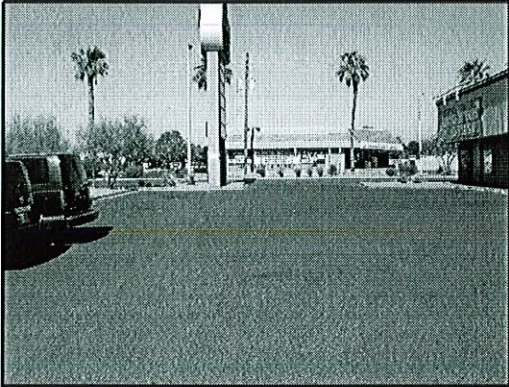
① VIEW 1