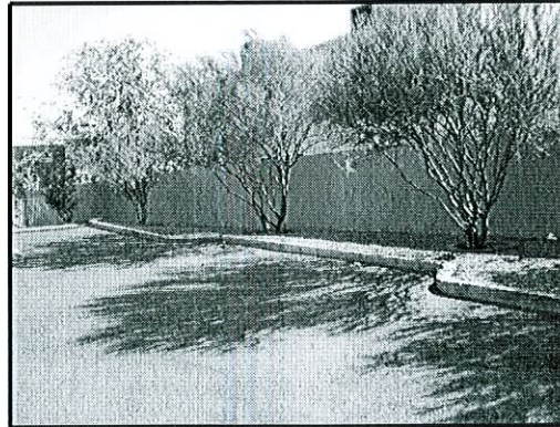
⑤ VIEW 5