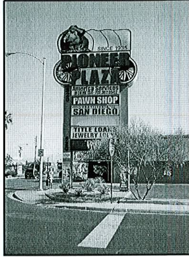
② VIEW 2