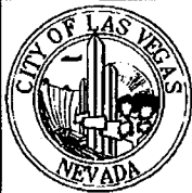
EXHIBIT "A" AS-BUILT CURB RETURN @ THE CORNER OF CLARK AVE. & 3RD ST. CITY OF LAS VEGAS, CLARK COUNTY, NEVADA

CITY OF LAS VEGAS - SURVEY 3001 RONEMUS DRIVE, LAS VEGAS, NEVADA 89128 (702) 229-6217