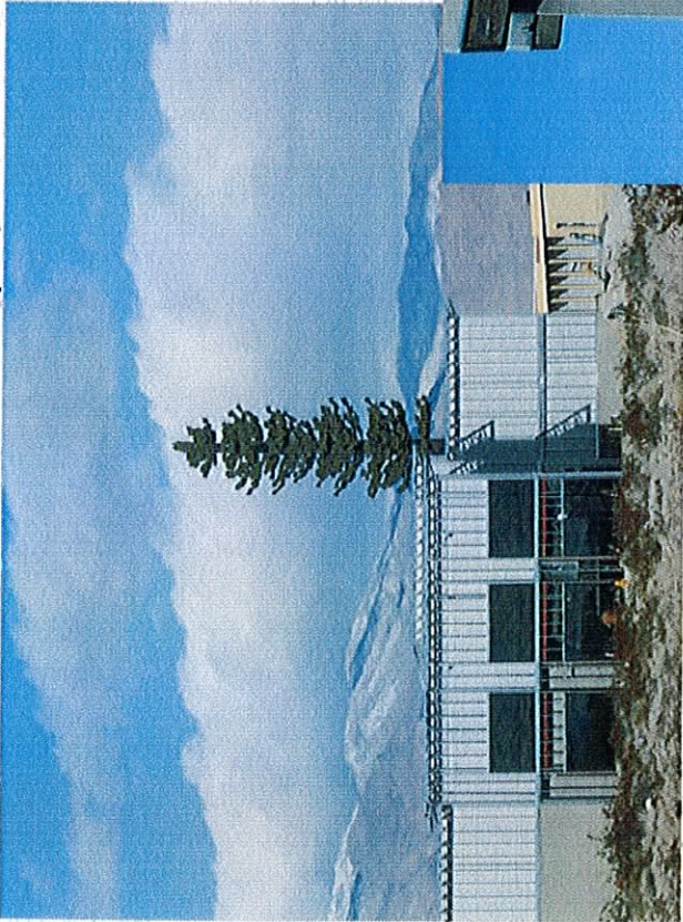
Example of Existing Site with Monopine