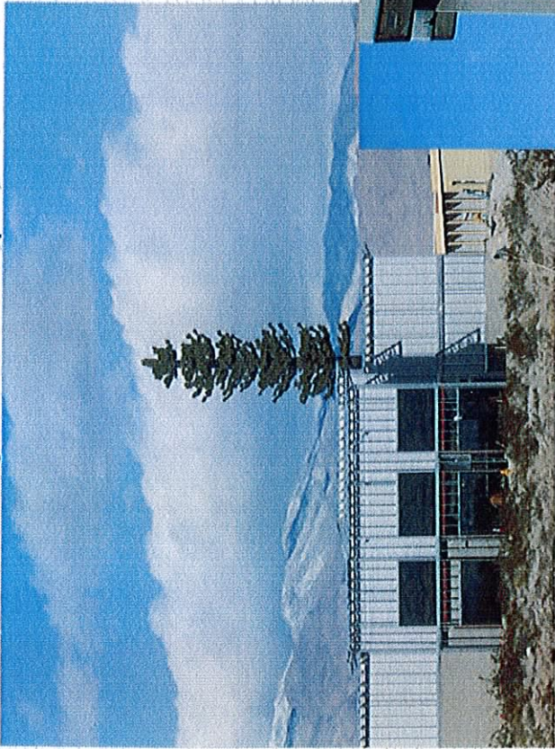
Example of Existing Site with Monopine