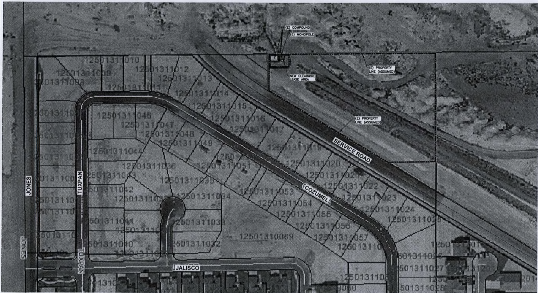
1 PARCEL MAP SCALE: N.T.S.

M LUNN & LANE 4843 EAST COTTAGE CENTER BLVD. BUILDING 2, SUITE 271 PHOENIX, AZ 85044 TEL: (602) 844-8130 FAX: (602) 844-9301