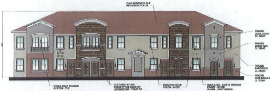
BUILDING B - SIDE ELEVATION