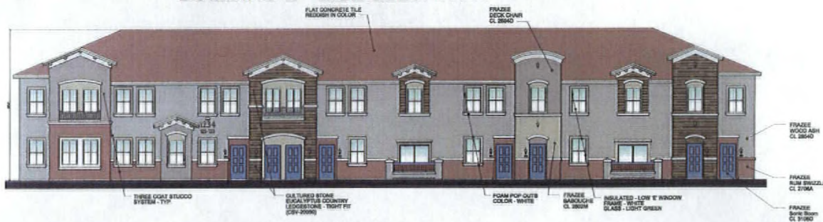
BUILDING C - SIDE ELEVATION