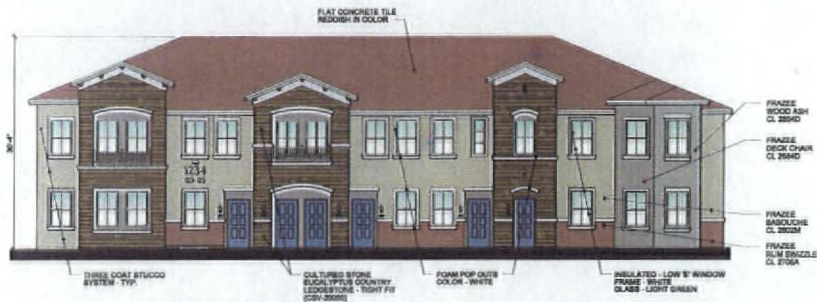
BUILDING A - SIDE ELEVATION