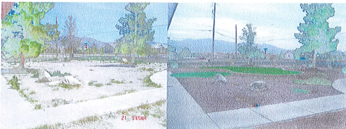
Front yard- NOW