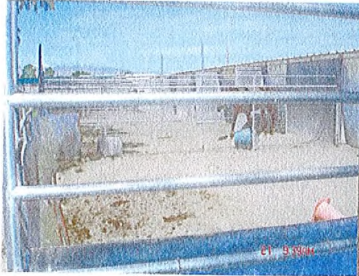
Horse stalls – before