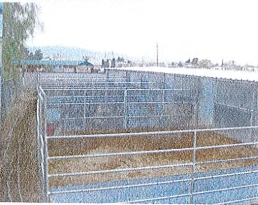
Horse stalls -now