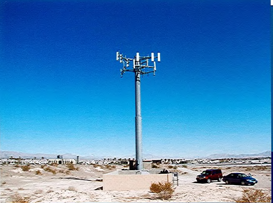
Existing 60' Monopole

Proposed 20' Monopole Extension with New Cricket 3-Antenna Array at 80'