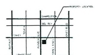
VICINITY MAP NTS NORTH