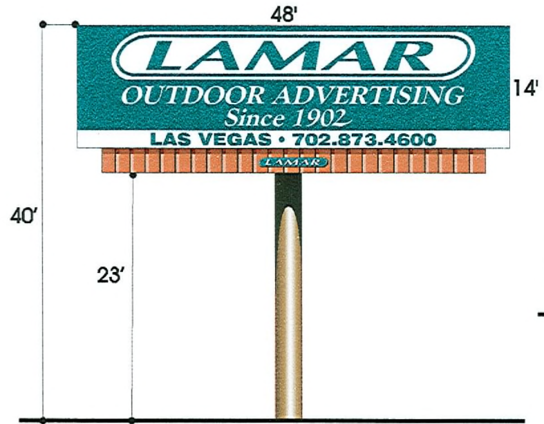
ELEVATION (NO SCALE)