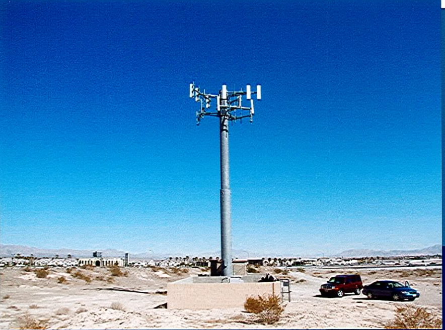
Existing 60' Monopole

Proposed 20' Monopole Extension with New Cricket 3-Antenna Array at 80'