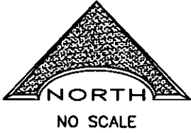
EXHIBIT " B " TO ACCOMPANY ENCROACHMENT APPLICATION SHEET 2 OF 2