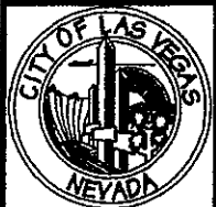
EXHIBIT TO ACCOMPANY LEGAL DESCRIPTION NEVADA POWER COMPANY EASEMENT POR NE 1/4 OF SEC 21, T 19 S, R 60 E, MDM CITY OF LAS VEGAS - SURVEY 3001 RONEMUS DRIVE, LV, NV 89128 ~ 702) 229-6217

DWG: NPC EASEMENT.PRO DRAWN BY: NJPA CHECKED BY: ARR SHEET 1 OF 1 DATE: JUNE, 2007