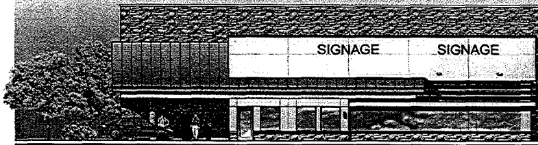
OFFICE BUILDING SOUTH ELEVATION 1/8" = 1'-0"