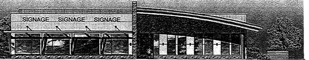
OFFICE BUILDING WEST ELEVATION 1/8" = 1'-0"