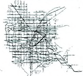
Site Zoning & Data