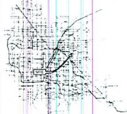
Site Zoning & Data