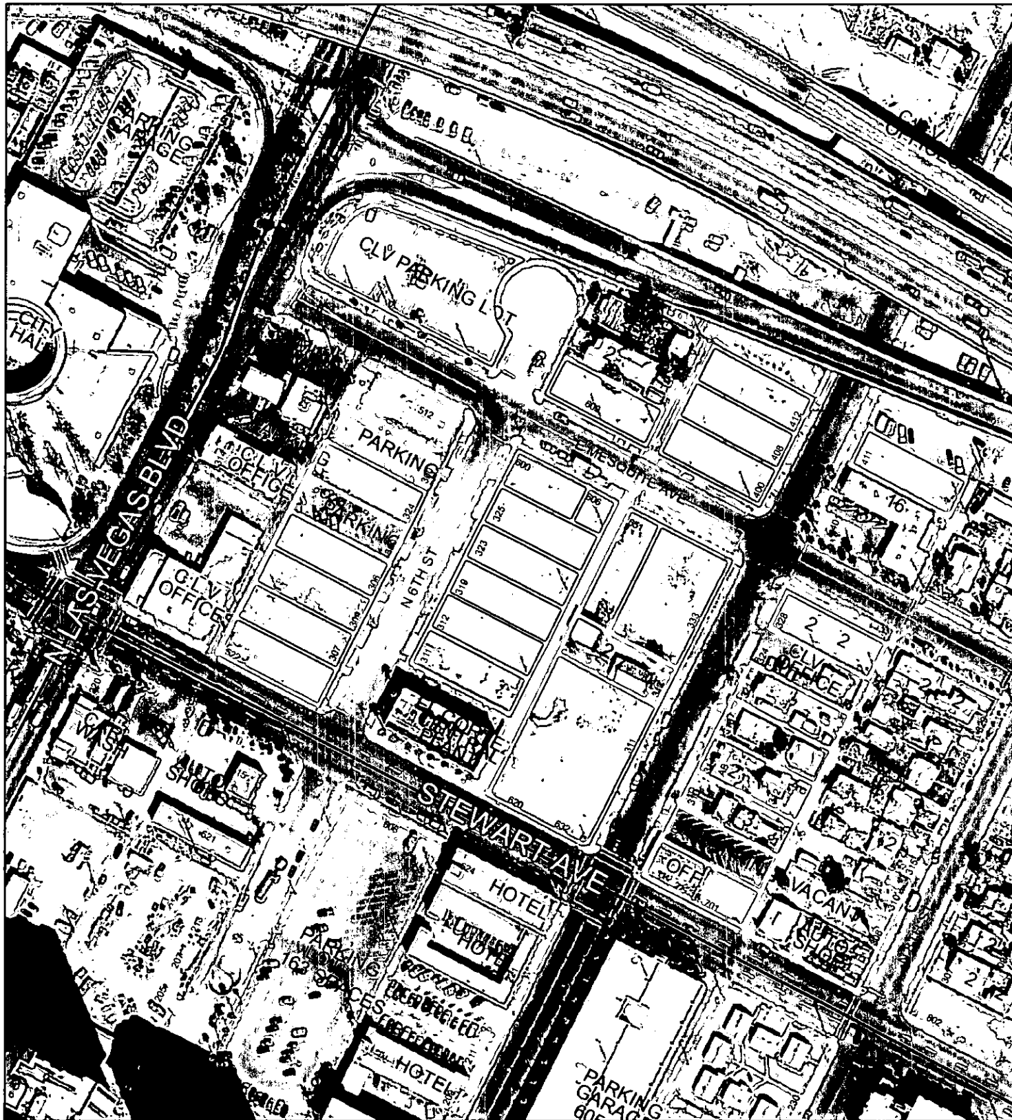
Exhibit A - Site Map