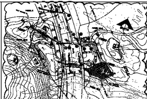
STORM DRAIN OUTLET DETAIL @ B.C.D. STA. 64+68.61