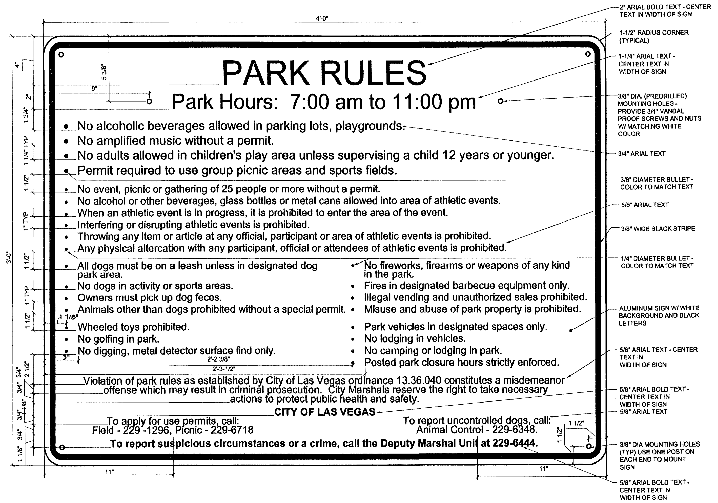
1 PARK RULES SIGN