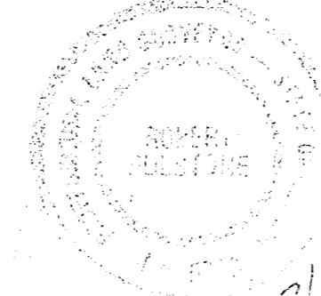
EXHIBIT PLAT MAP # 100 RECORD # 20154

I HEREBY CERTIFY THAT I AM A LICENSED SURVEYOR AND THAT THIS MAP IS A TRUE AND ACCURATE REPRESENTATION OF THE LAND SURVEYED UNDER MY SUPERVISION AT THE INSTANCES OF THE SURVEYOR AND COMPLETED ON JULY 15, 1993.