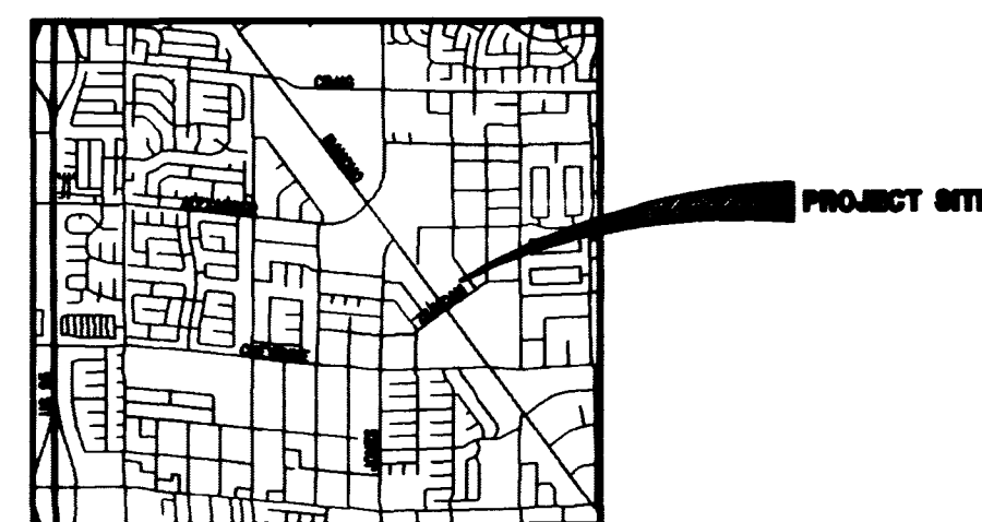
AREA MAP SCALE: NONE