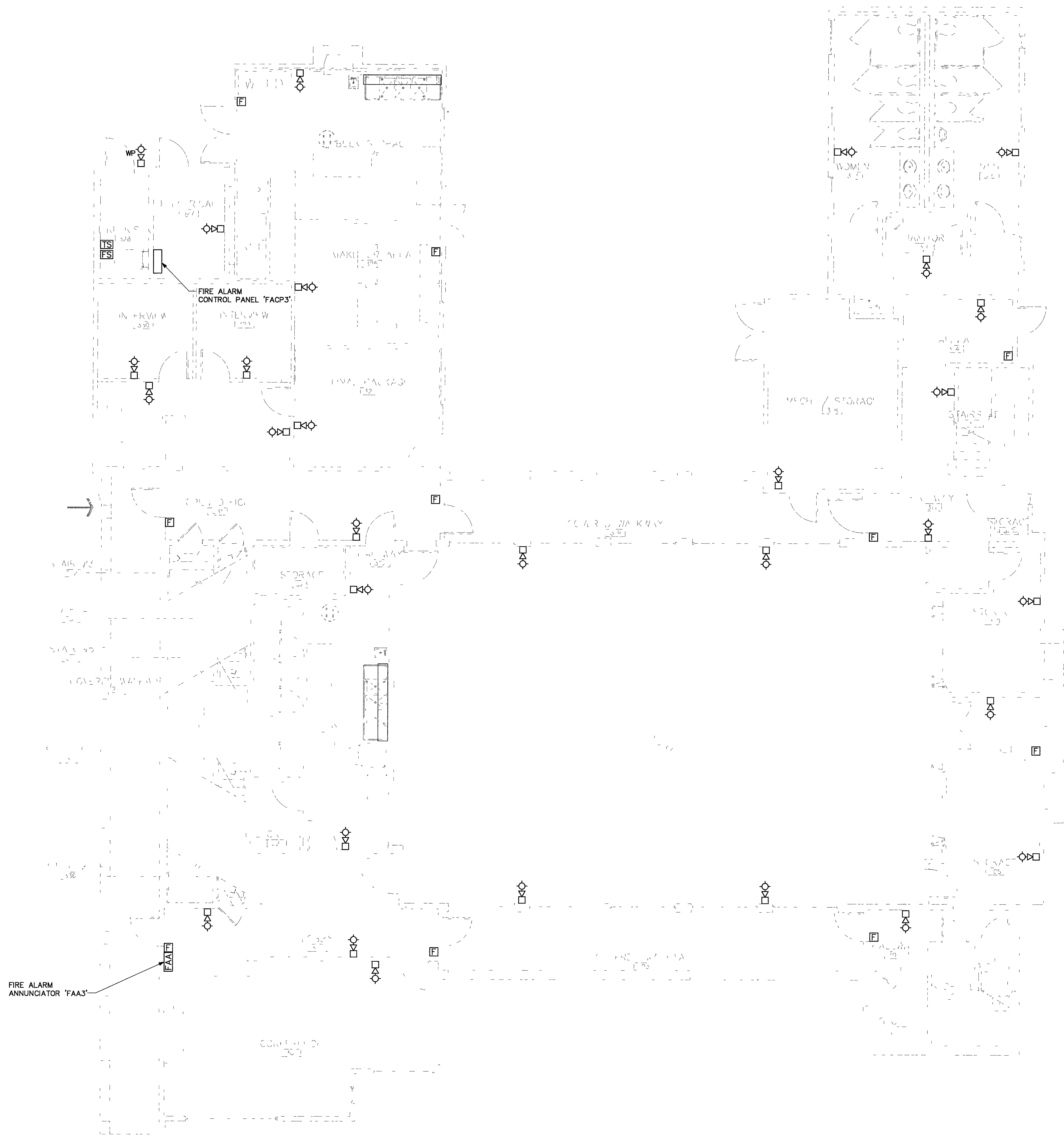
FIRE ALARM PLAN FLOOR 1 BUILDING III SCALE: 3/16"=1'-0"